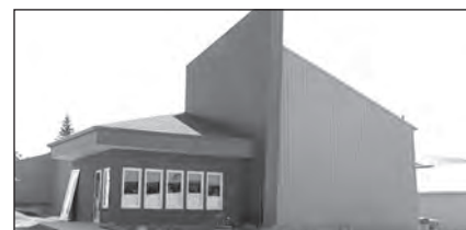
Boissevain Theatre received $2,000 to install an air conditioning system