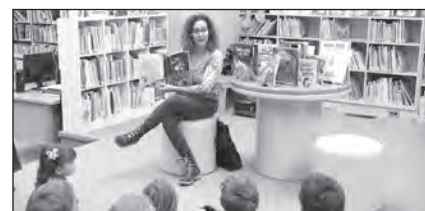
Boissevain Library received $3,650 to update furniture