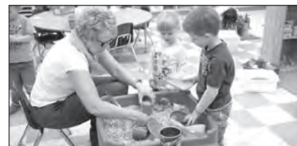
Boissevain Nursery School received $1,165 to upgrade learning games/toys