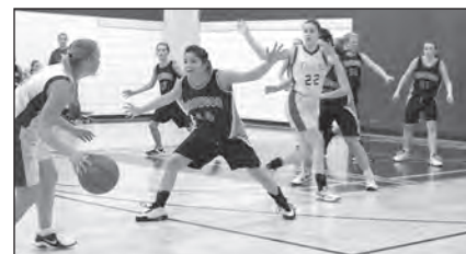
Boissevain School received $3,500 for floor cover for gym hardwood