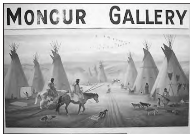
Moncur Gallery received $700 for Seven Layer Heritage Map