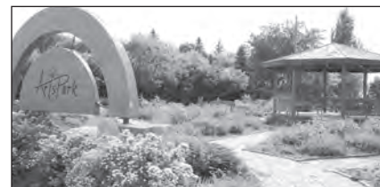
Arts Council received $3,500 for paving at ArtsPark