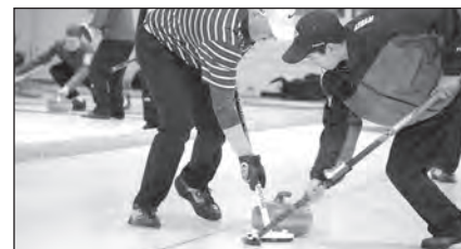
Boissevain Curling Club received $2000 to replace walkways