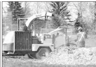
BMF Special Project in conjunction with Town hired wood chipper