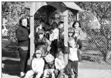
Tiny Turtle Playroom received $3,000 for playground upgrades and landscaping