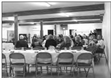
Boissevain Community Centre received $1,500 to purchase plastic tables