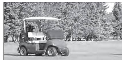
Boissevain Golf Club received $4,000 for path-way development