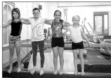
Turtle Mountain Twisters received $1,428 to replace carpet in viewing area