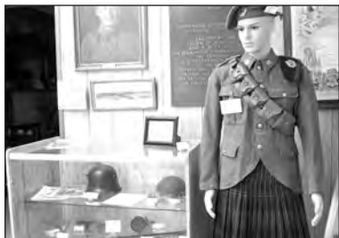
Beckoning Hills Museum received $1,057 to upgrade mannequins

Donations from October 16, 2013 to October 15, 2014: $177,000 in donations received